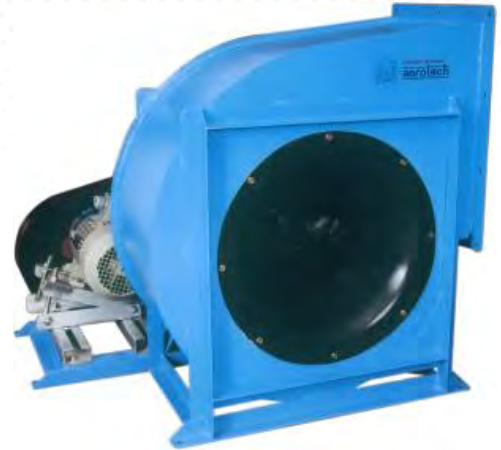
Sizes 12 to 72 Type SWSI & DWDI